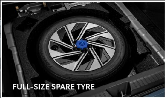
FULL-SIZE SPARE TYRE